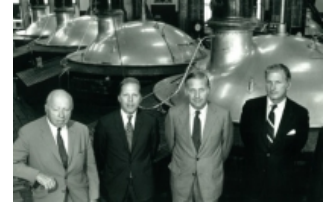
How To Blow $9 Billion: The Fallen Stroh Family