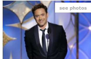
The 2014 Celebrity 100